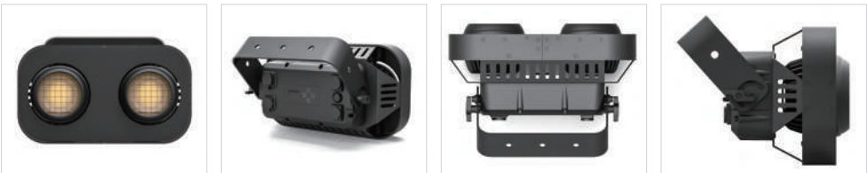
Housing color ■■■